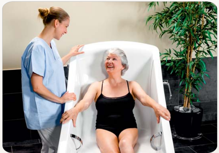
Comfortable interior design with much space within the shoulder and back area.

The ergonomical inside shape and the "homey" character of the tub shape provide altogether a protecting character for the bathing person and increase thereby significantly the well being.